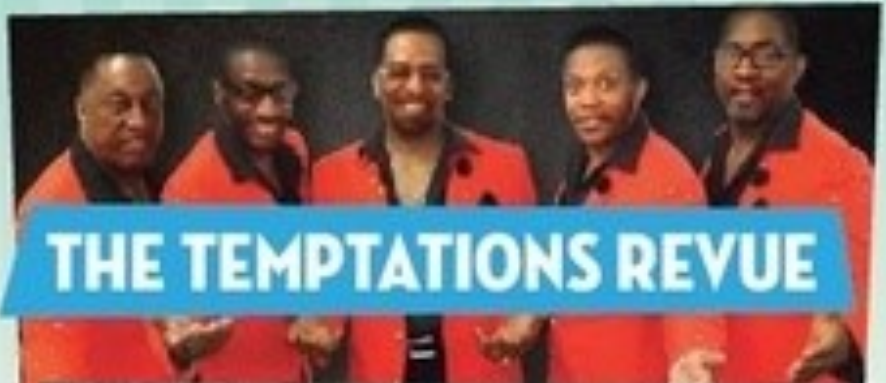
THE TEMPTATIONS REVUE