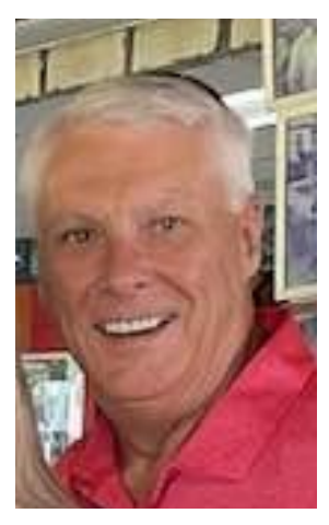
Sgt at Arms