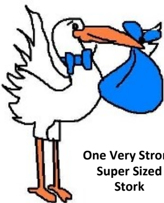
One Very Strong Super Sized Stork

We will start loading at 655 St Andrews Rd. at 5:00pm, with departure at 5:30pm. Personal coolers and drinks of your choice are welcome on the bus.... And of course if you want to share have at it. Lynn's has agreed to wave the cover charge and provide us with appetizers... and we know it will be a great time. We plan to leave around 11:00pm which should put us back in Columbia by 12:30 am. The cost is still $20 and we will set aside the month of April for Members to sign up, then if we aren't full we will open it to all of your friends in May. We will take the first 54 who sign up on the bus. And then of course let us know if you are going to come up in cars so we can let Lynn's know how many we will have coming.